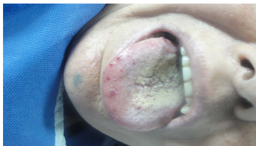
Figure 1 The telangiectasia of the tongue.

Hereditary haemorrhagic telangiectasia (HHT) is an uncommon autosomal dominant disease that occurs on mucocutaneous surfaces (ie, nose, gastrointestinal tract and skin), lung, liver and brain. 1 The Curaçao criteria was developed for the