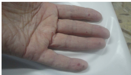
Figure 2 The telangiectasia of the fingertips.